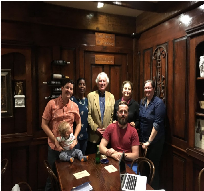
A meeting of the DC-area Associate Member Group